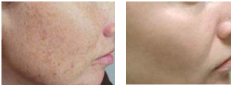
Before and After, using IPL with the LUX G; patient had 3 treatments.