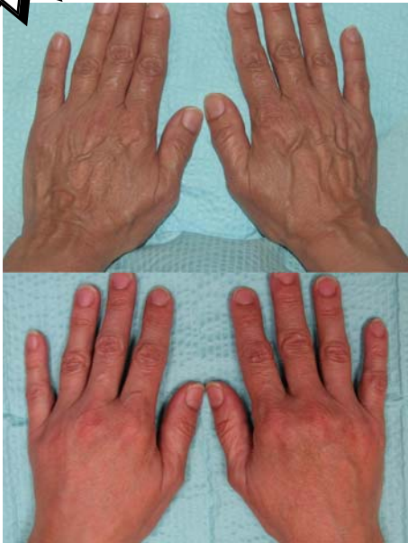
Nurse Sue's hands, Before and 1 wk later

The special is $200 off, and it includes a coupon for 50% off a StarLux 500 IPL treatment for easy brown spot removal, if needed. Limited time offer only. The appointment must be scheduled before March 15, 2008. Dr. Klein, Michelle and Marcia are all trained to do this procedure.